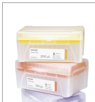
Single Tray racks purity-certified tip racks