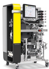
Hipersep® Flowdrive Pilot

To ensure optimal performance where pressurized tanks or feeds are not appropriate, the Hipersep® Booster Module offers the capability to boost inlet pressure to the high-pressure pumps. This accessory is available for the Hipersep® Flowdrive Pilot and the Hipersep® Flowdrive Process M Low Flow.