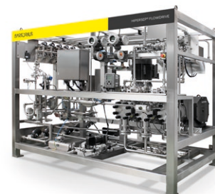
Hipersep® Flowdrive XXL