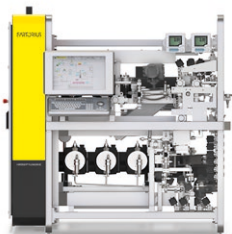
Hipersep® Flowdrive Process M